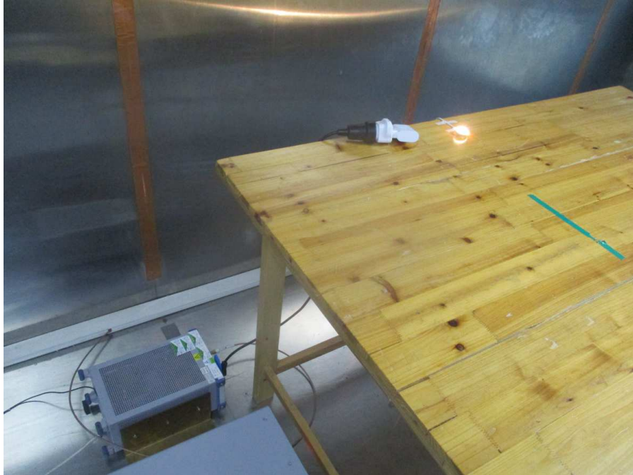
Photograph 1: Set-up for measurement of conducted emission