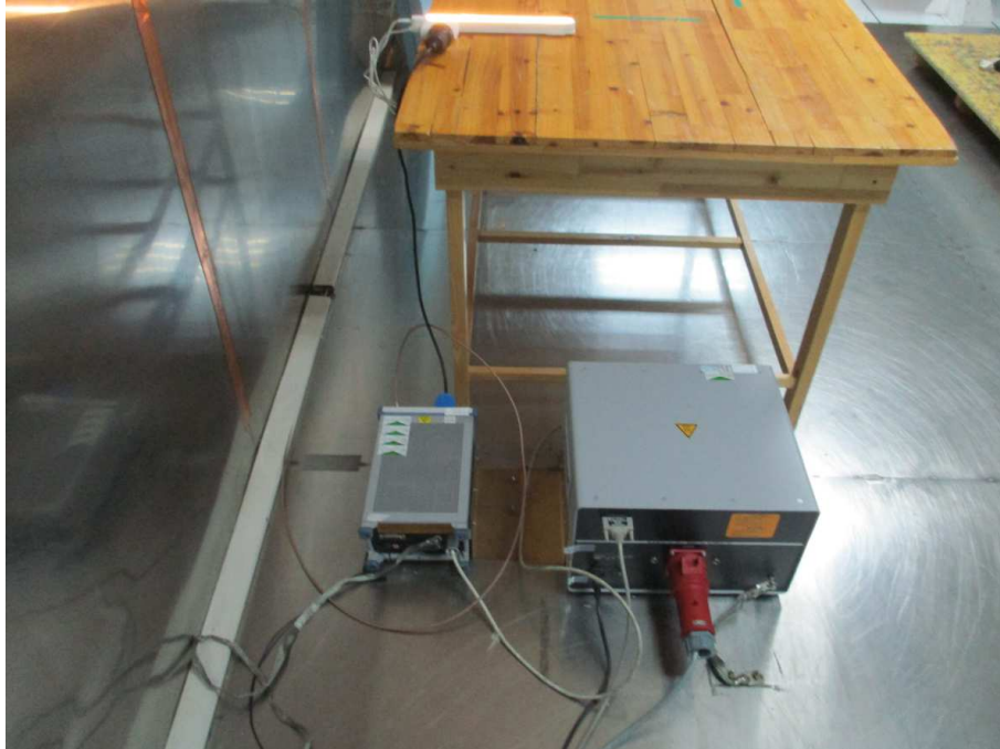
Photograph 1: Set-up for measurement of conducted emission