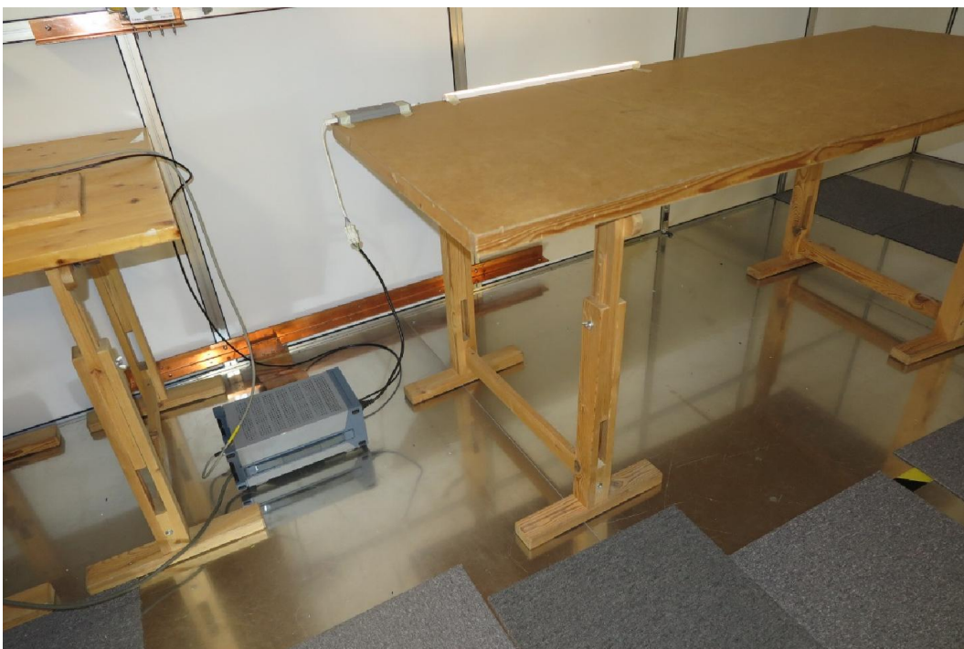
Test setup for conducted emission 150 kHz – 30 MHz, with ICPSLC24-10NA-IL-1