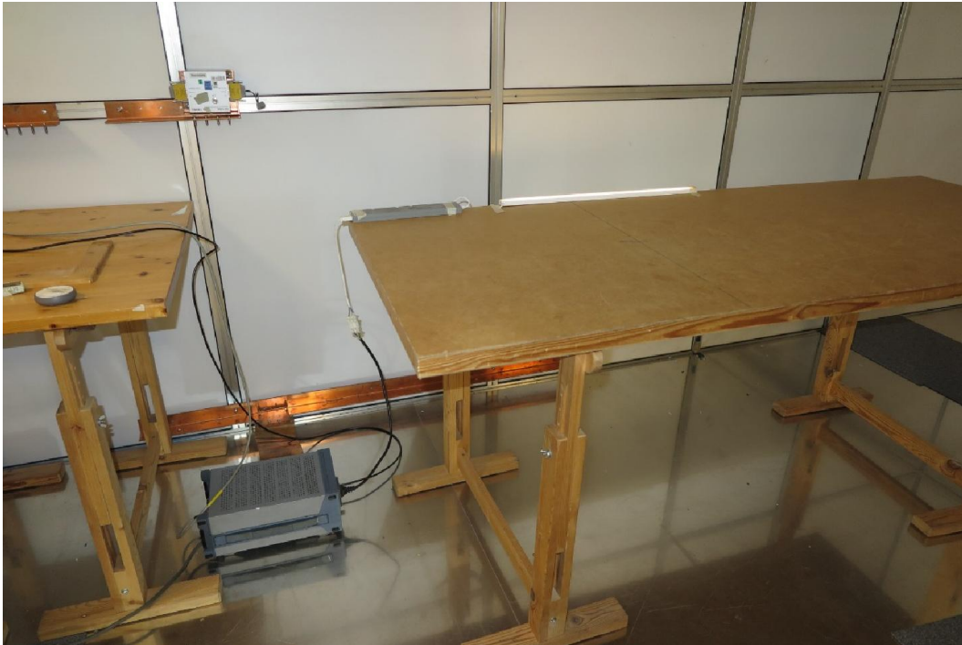
Test setup for conducted emission 150 kHz – 30 MHz, with ICPSLC24-30NA-IL-1