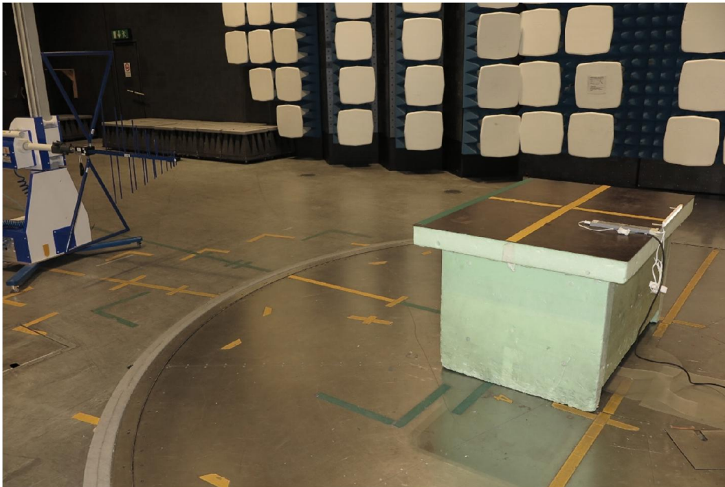
Test set up radiated emission 30 MHz – 1 GHz, with ICPSLC24-30NA-IL-1