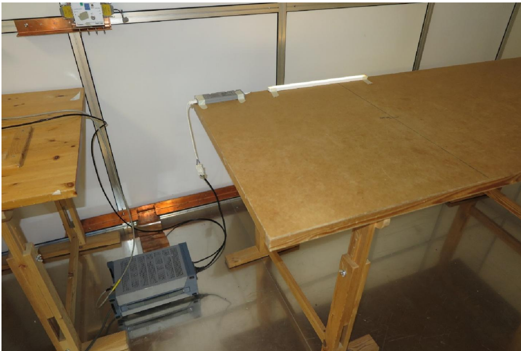
Test setup for conducted emission 150 kHz – 30 MHz, with ICPSLC24-10NA-IL-1