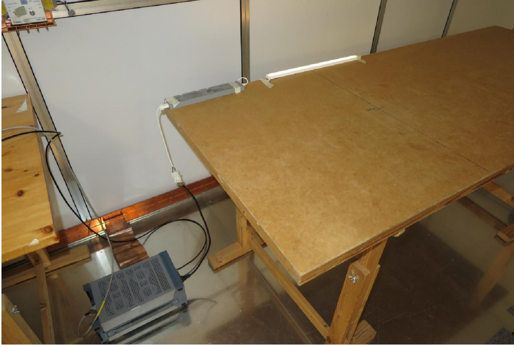
Test setup for conducted emission 150 kHz – 30 MHz, with ICPSLC24-30NA-IL-1