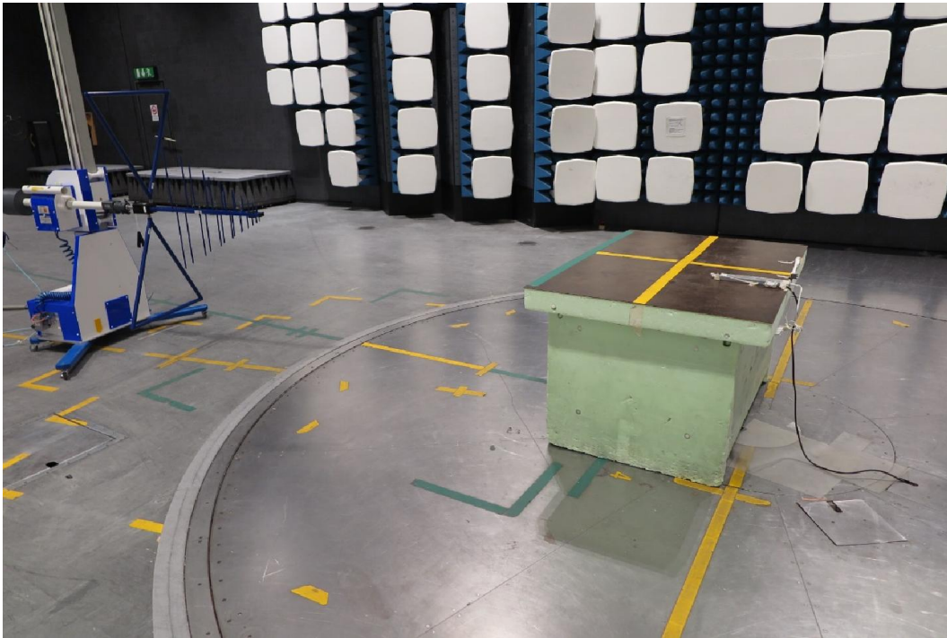
Test set up radiated emission 30 MHz – 1 GHz, with ICPSLC24-30NA-IL-1