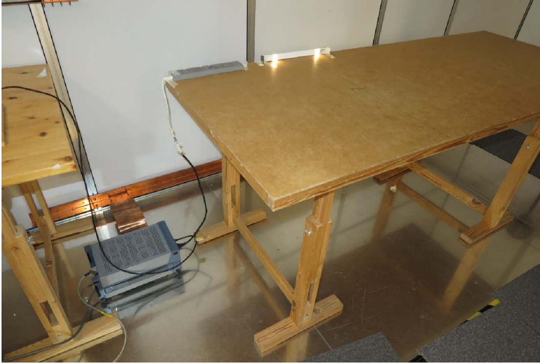
Test setup for conducted emission 150 kHz – 30 MHz, with ICPSLC24-30NA-IL-1