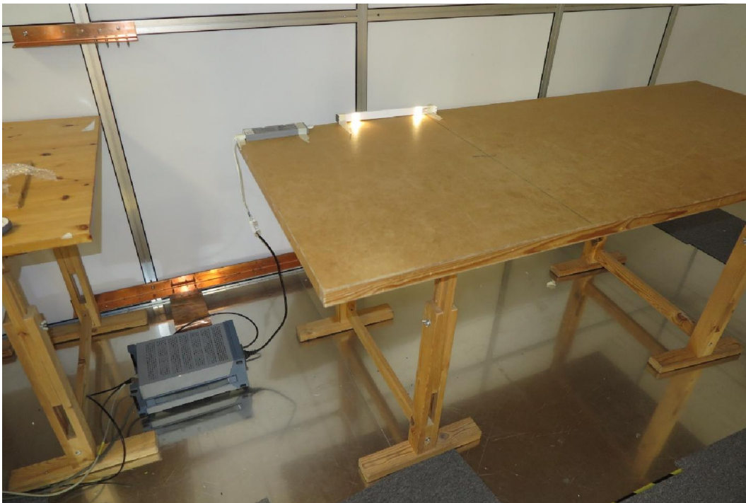
Test setup for conducted emission 150 kHz – 30 MHz, with ICPSLC24-10NA-IL-1