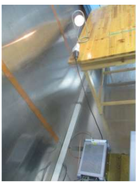
Photograph 1: Set-up for measurement of conducted emission