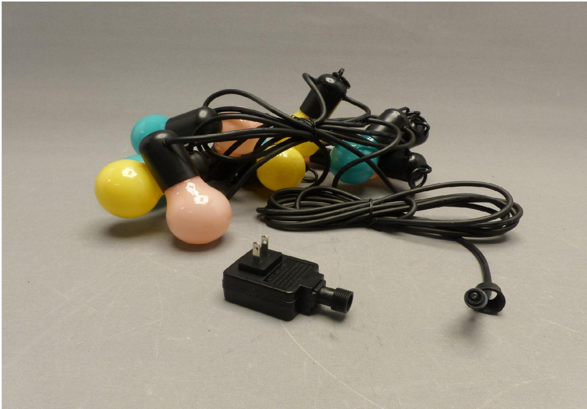
J1752-1 Solvinden - External view