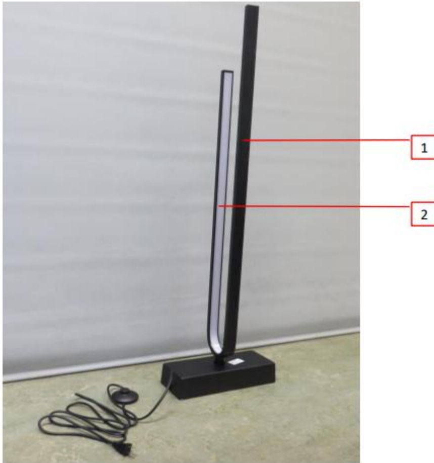
Photo 1 - Overall view