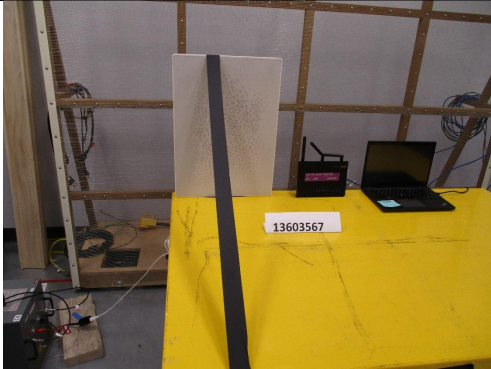
Photo of test setup for Mains Conducted Emissions