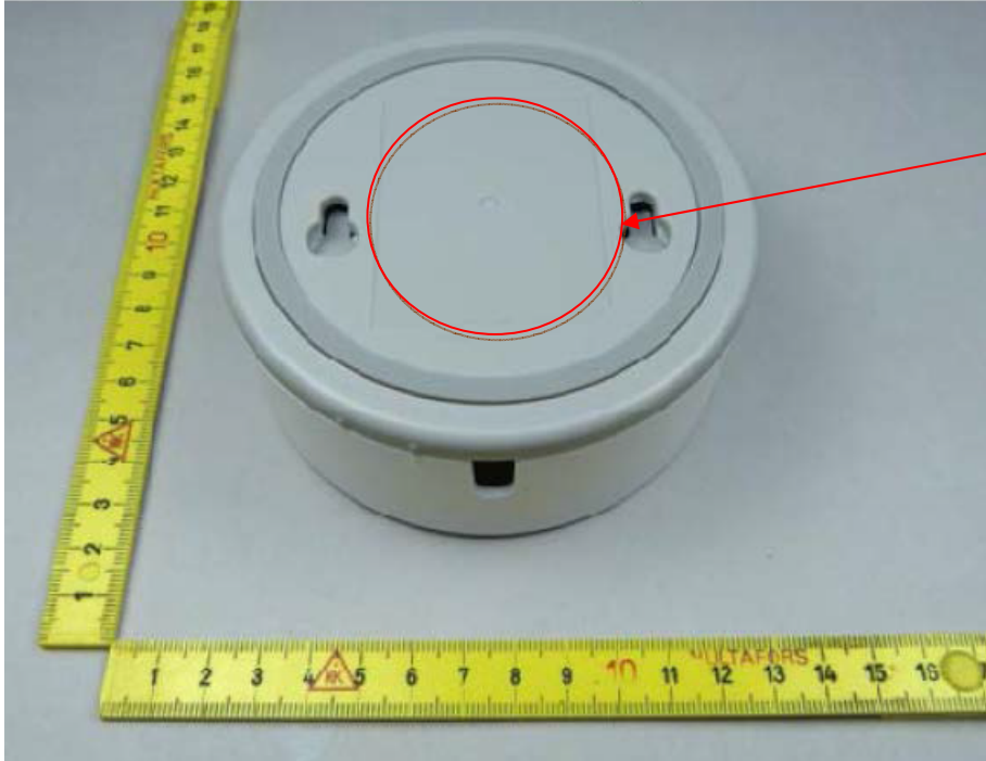
External view of E1526 TRÅDFRI, bottom