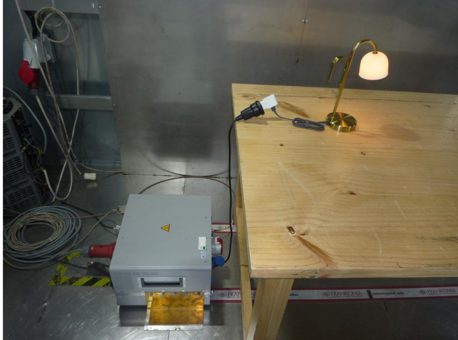
Photograph 1: Set-up for measurement of conducted emission