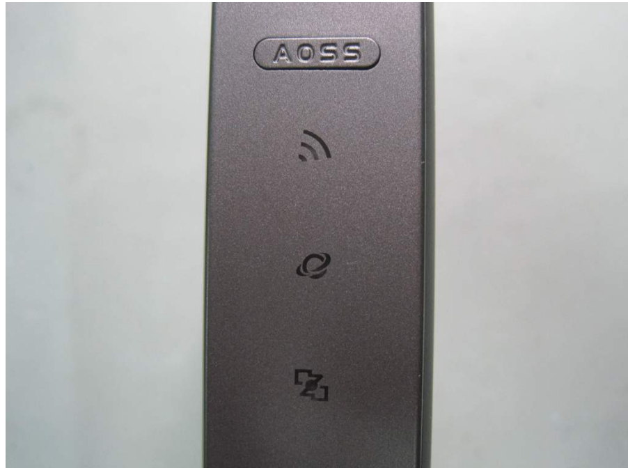
Adapter Brand: APD Model: WA-36A12