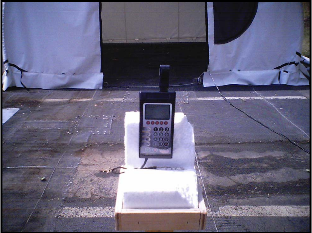
Photograph 3: Radiated Testing – Front View