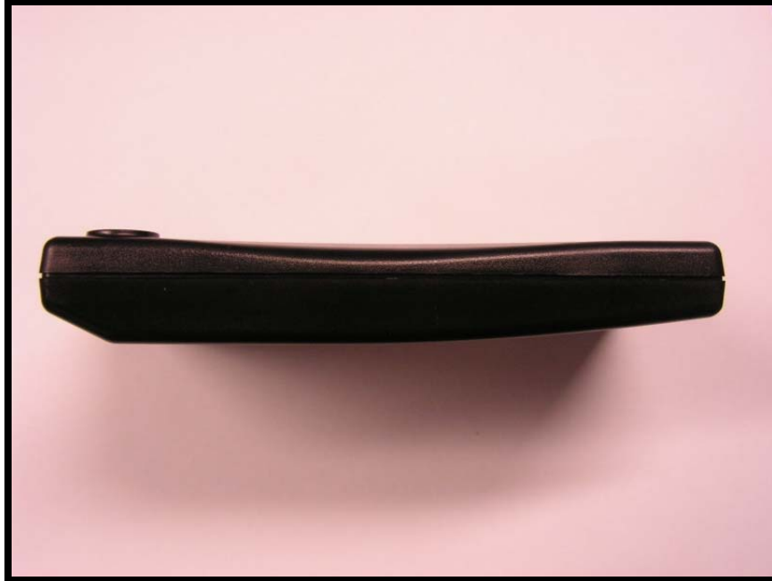
Photograph 9: Side Face Right