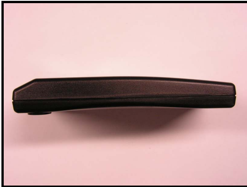
Photograph 10: Side Face Left