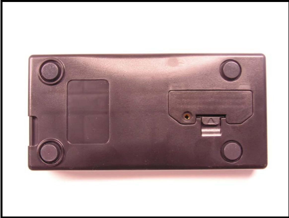
Photograph 6: Bottom of Case