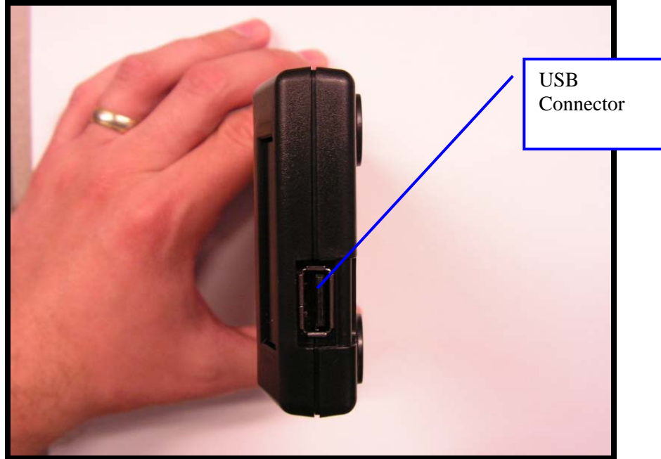
Photograph 7: Side Face Top