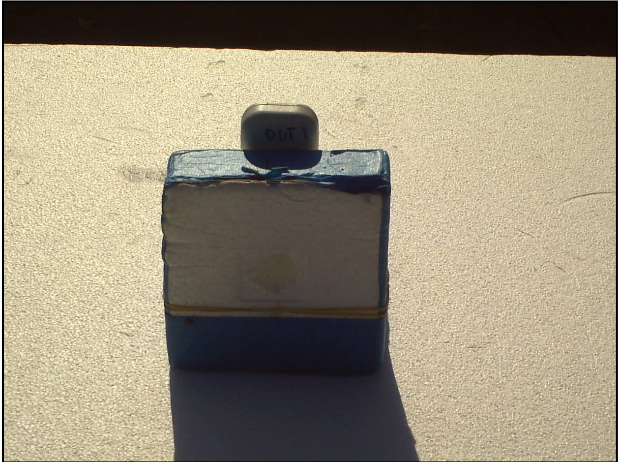
Photograph 2: Radiated Testing – Back View