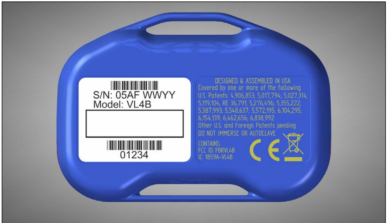
Photograph 2: "Contains FCC ID..." Label Sample on Sample Enclosure

Client: Fleetwood Group, Inc. Model: VL4B Standards: FCC 15.231/IC RSS-210 FCC/IC ID: FBRVL4B/1859A-VL4B Report #: 2010155