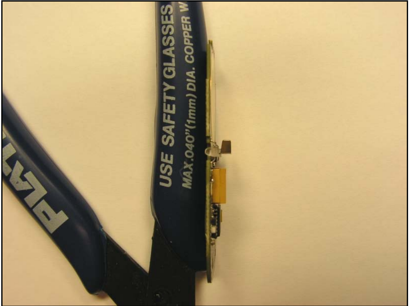
Photograph 7: Side 1 View