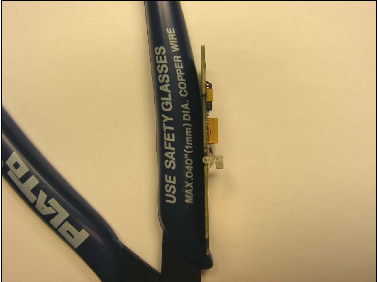
Photograph 8: Side 2 View