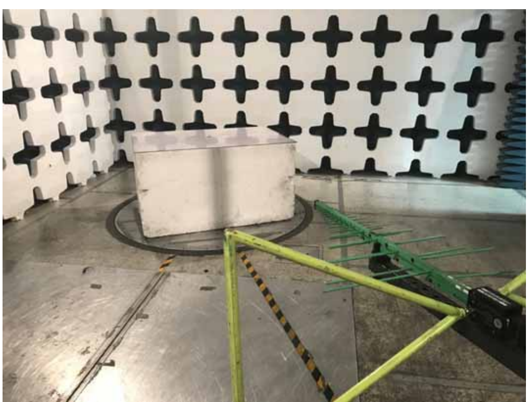
Figure 3 – Test Setup for Radiated Emissions, 30MHz to 1GHz – Horizontal Polarization