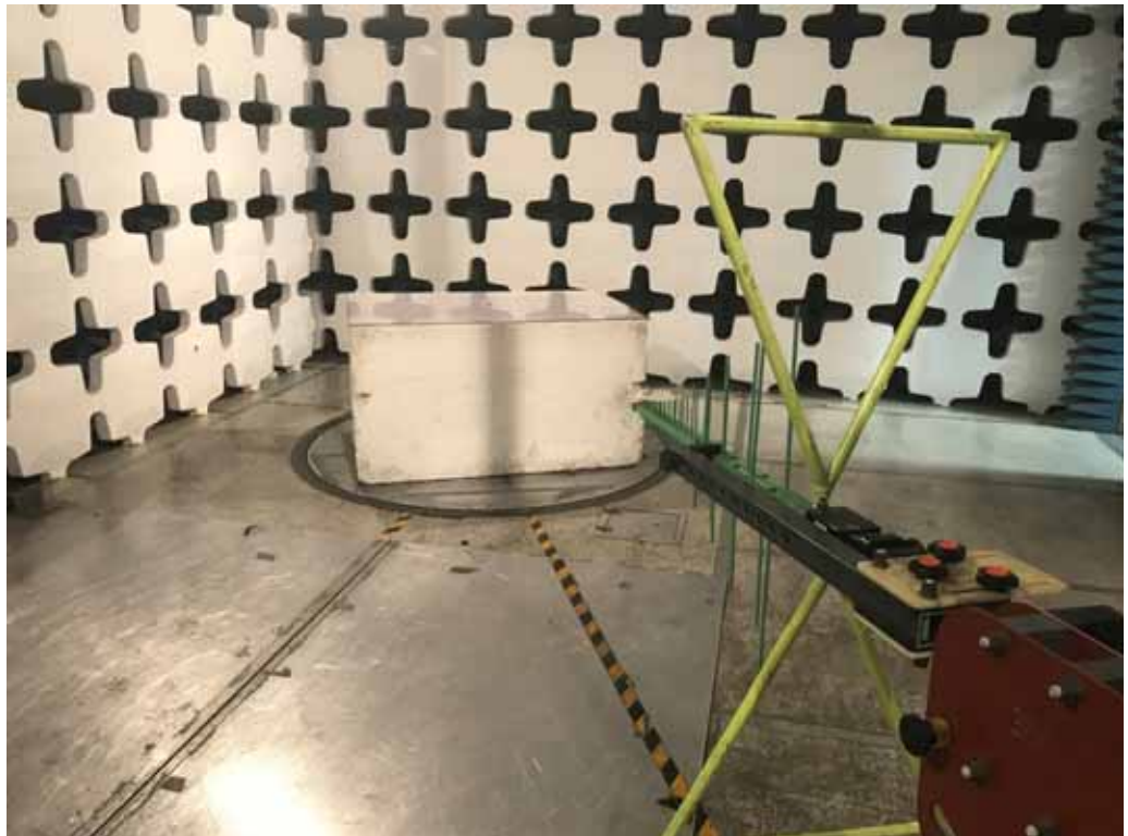
Figure 4 – Test Setup for Radiated Emissions, 30MHz to 1GHz – Vertical Polarization