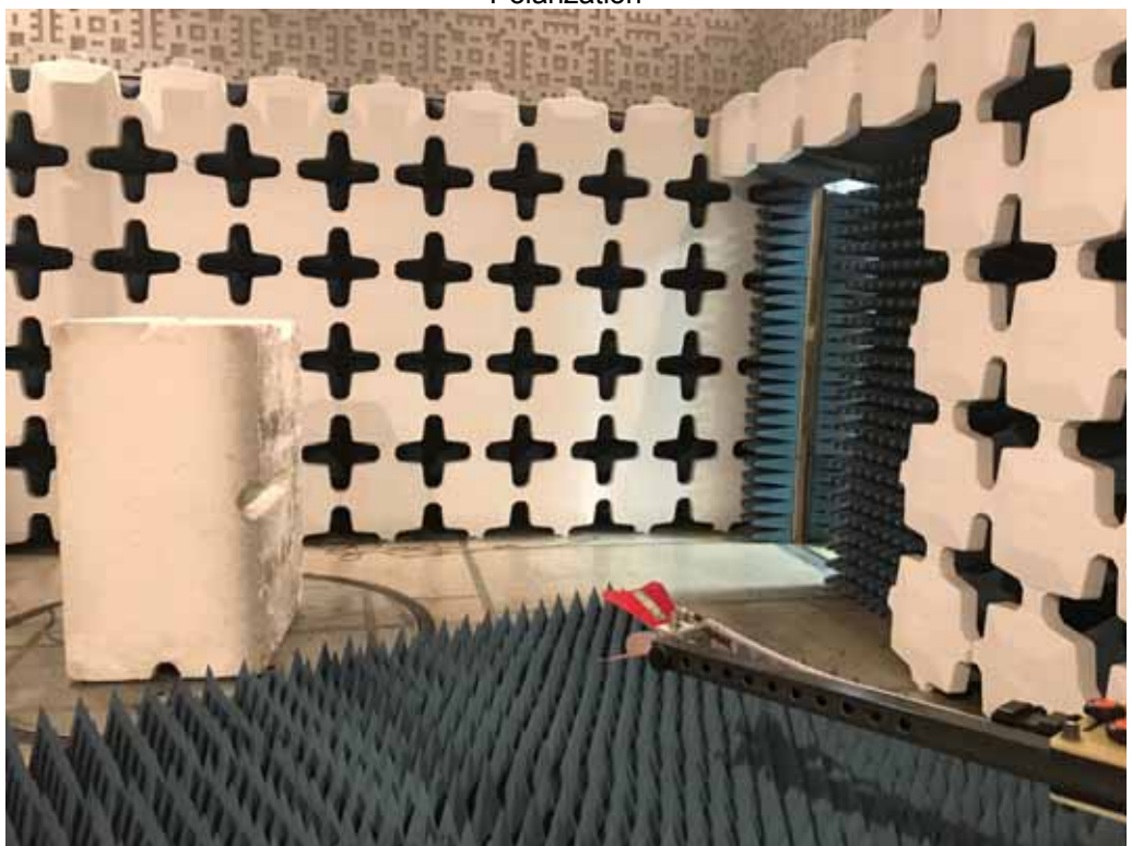
Figure 6 – Test Setup for Radiated Emissions, 1GHz to 25GHz – Vertical Polarization