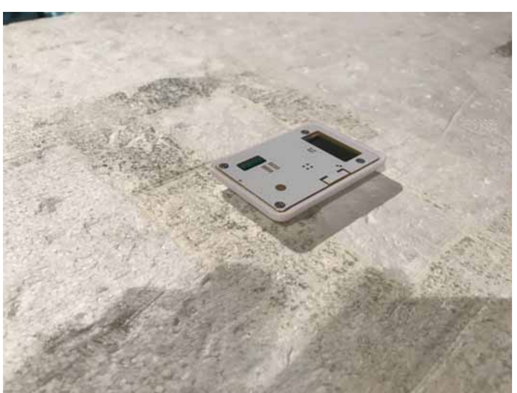
Figure 2 – Photograph of EUT