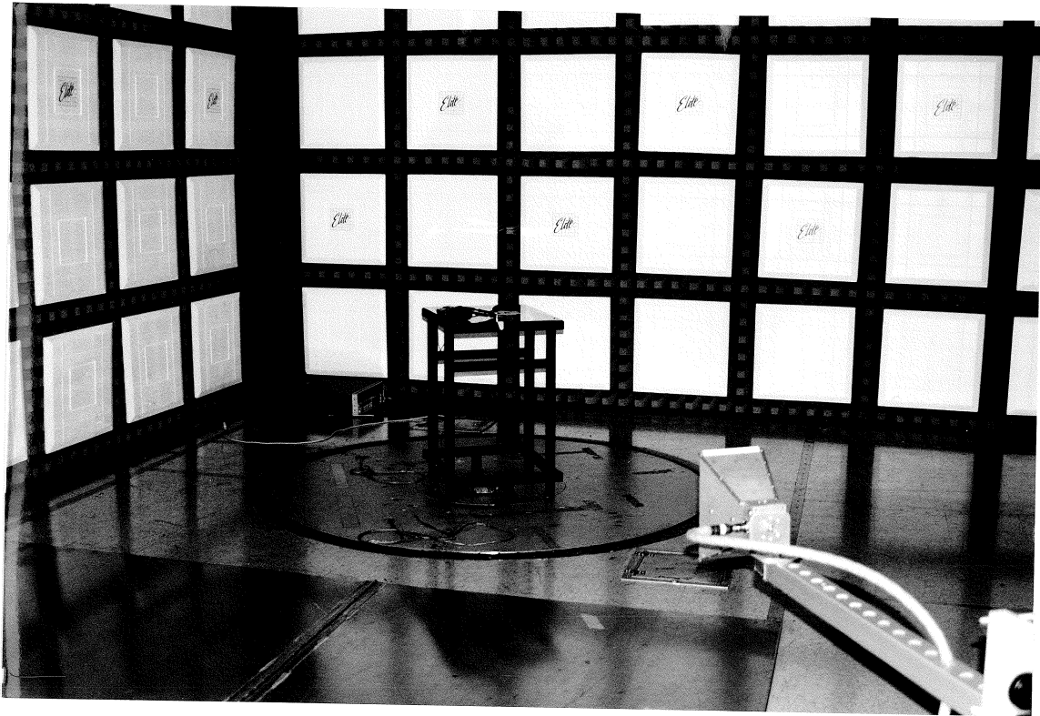
Radiated Emissions Worst Case Horizontal Polarization