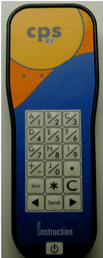
eInstruction cpsRF HE keypad topside. Note uni-body case, single LED indicators and membrane keypad contact type.