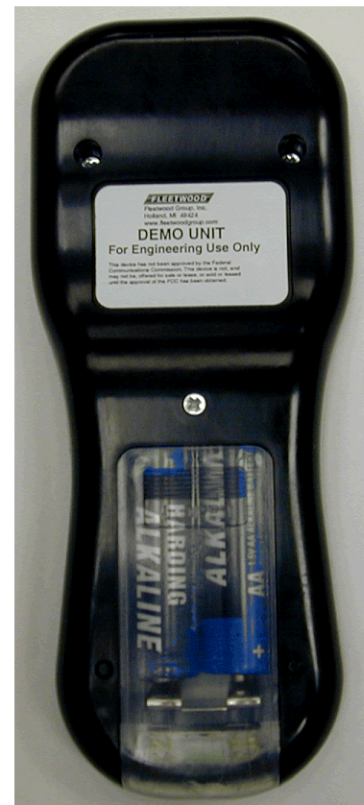
Reply WW keypad bottom-side.