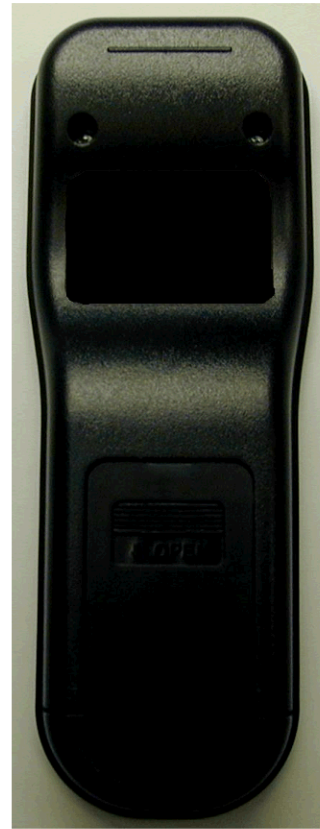
eInstruction cpsRF HE keypad bottom-side. Note this image is of older non-embossed label version.