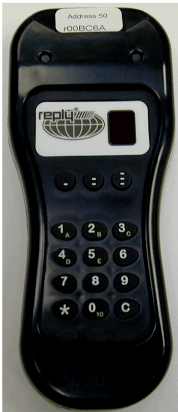
Reply WW rubber-key keypad topside. Note clamshell case, 7-segment LED display and rubber-key keypad contact type.