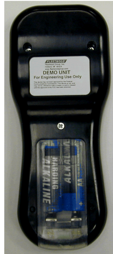
Reply WW keypad bottom-side.