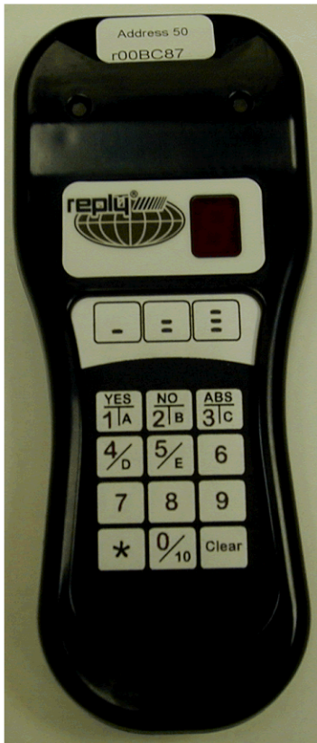
Reply WW membrane-key keypad topside. Note clamshell case, 7-segment LED display and membrane-key keypad contact type.