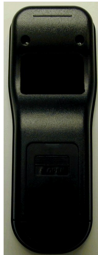
eInstruction cpsRF HE keypad bottom-side. Note this image is of older non-embossed label version.