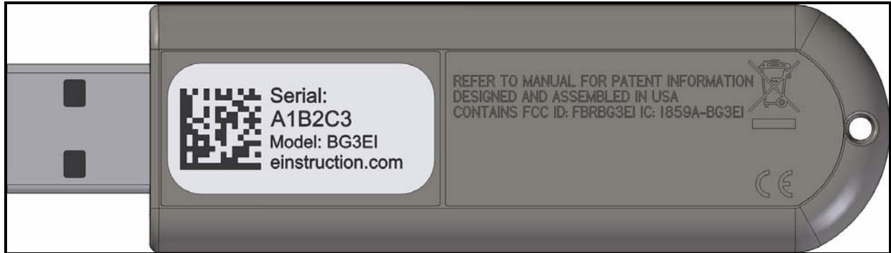
Photograph 2: “Contains FCC ID:..... IC:.....” Label on Typical Host

Client: Fleetwood Group, Inc. Model Name: BG3EI Standards: FCC 15.247/IC RSS-210 FCC/IC ID: FBRBG3EI/1859A-BG3EI Report #: 2009150