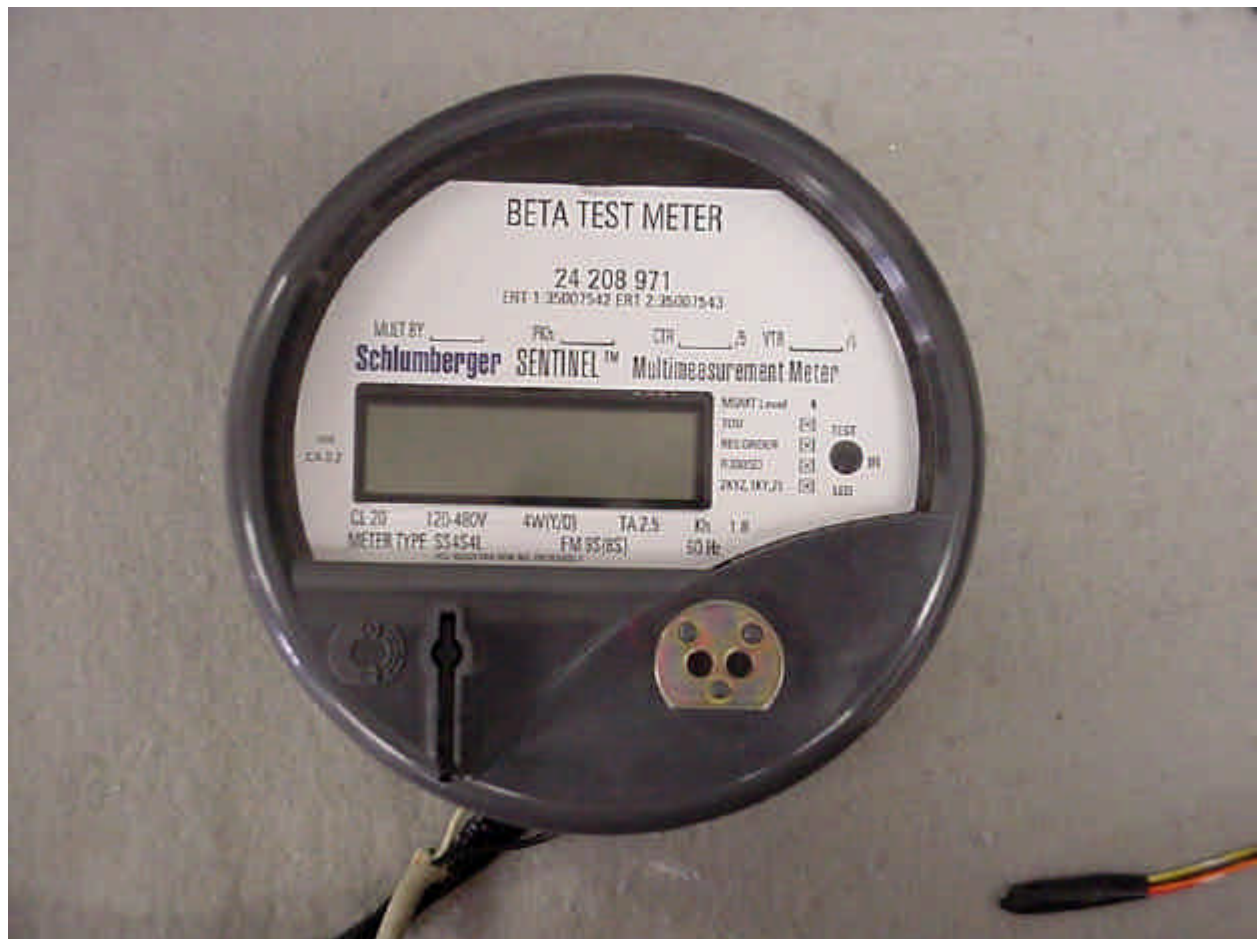
Photo 1. EUT, Front View of Meter as Tested