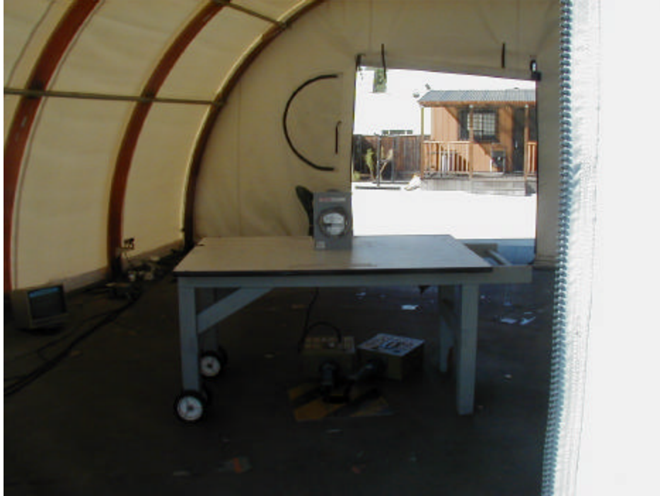
Radiated Measurements Below 1 GHz