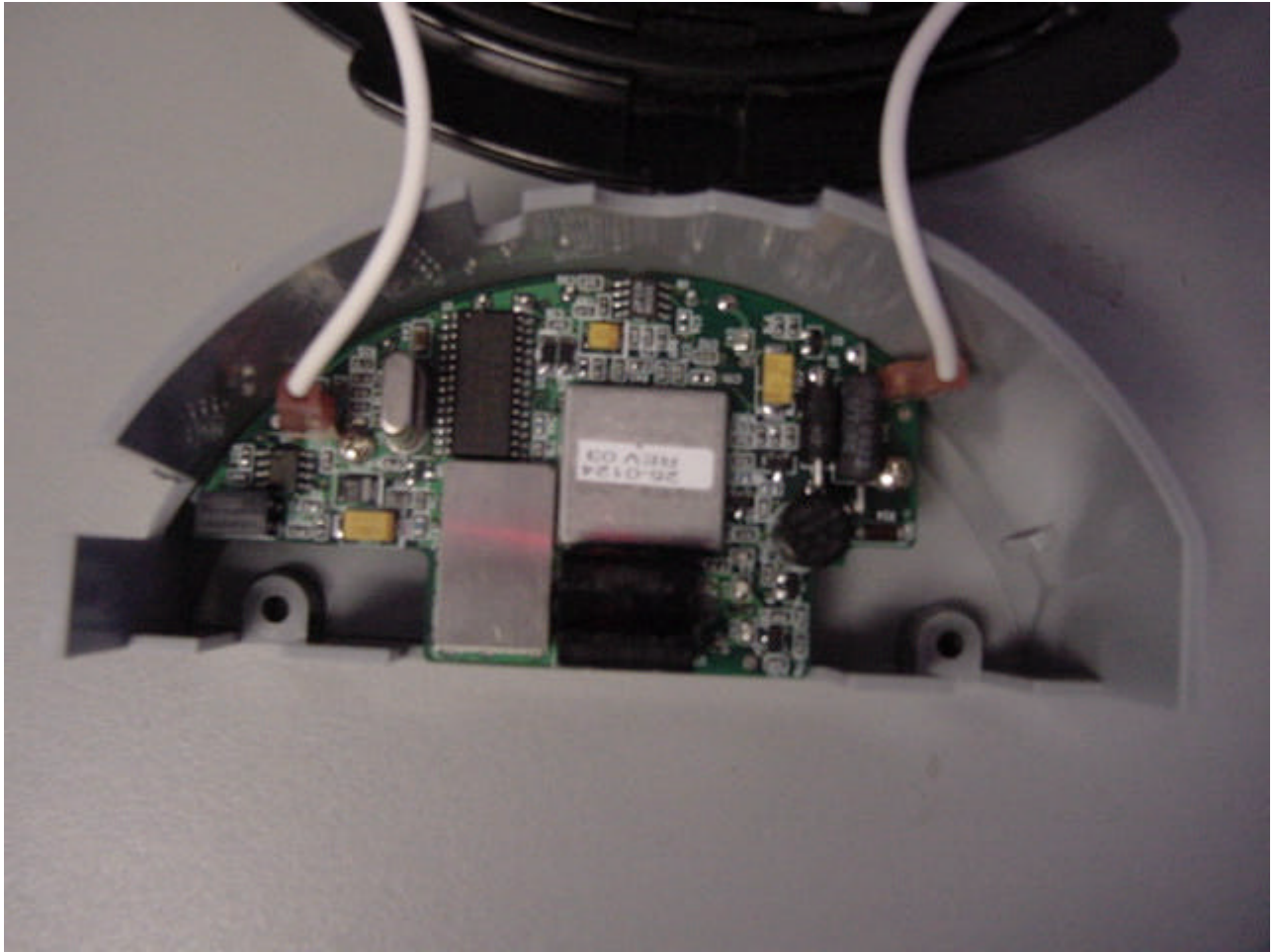
Close-up of the transmitter board inside the plastic enclosure (3 of 3)