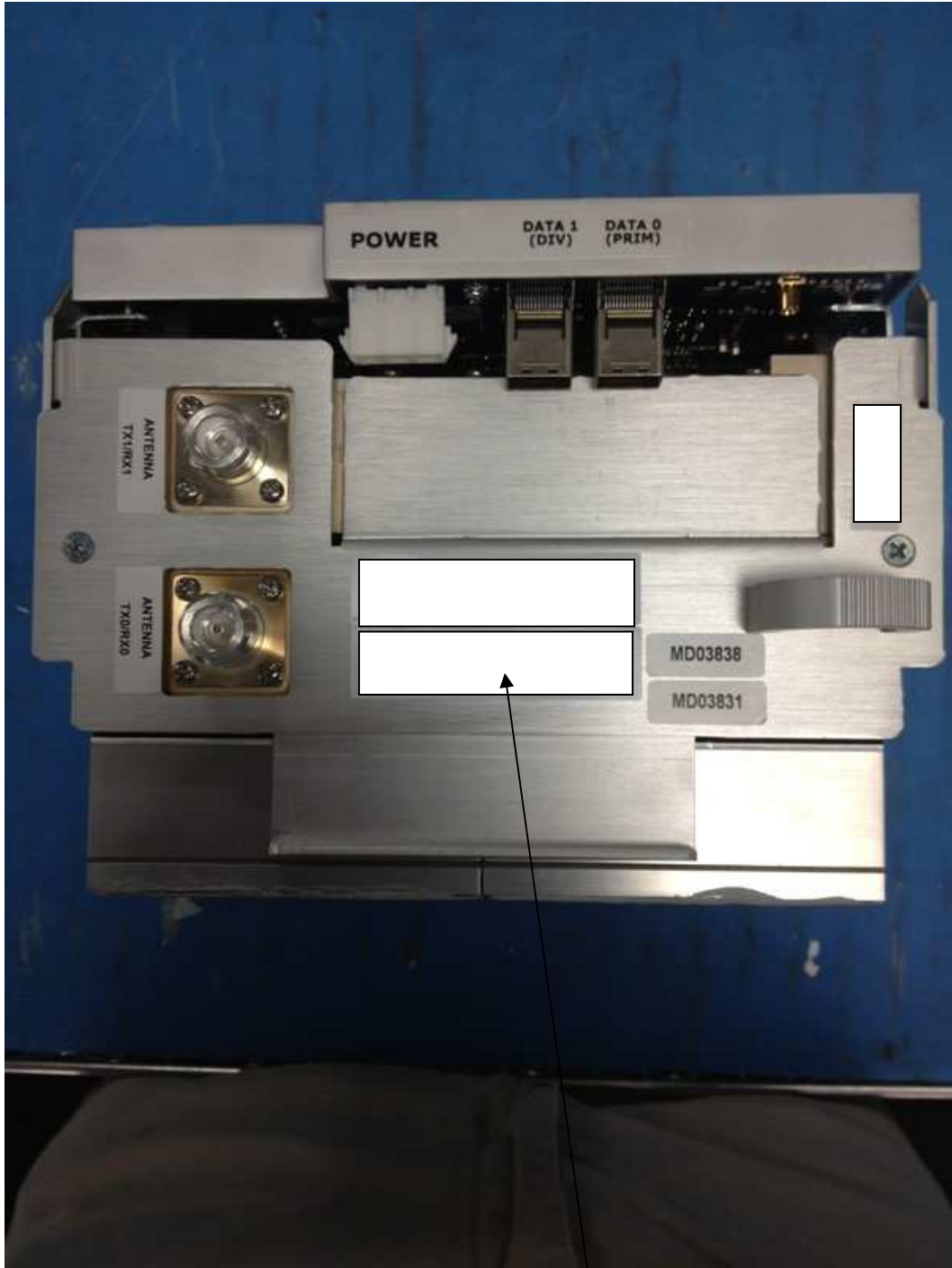
RF Module Assembly #1