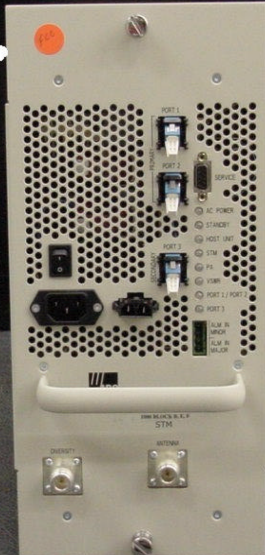
Digivance 1900 MHz LRCS Signal Transport Module Front View