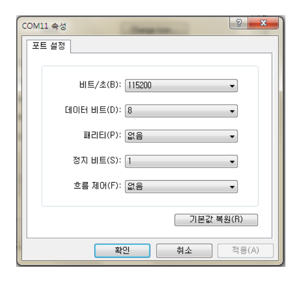
Figure 1. HyperTerminal communication port settings screen

A terminal program is used for controlling or setting serial ports. The terminal program described in this manual is HyperTerminal provided with MS Windows. For more information on HyperTerminal, see the MS Windows Help.