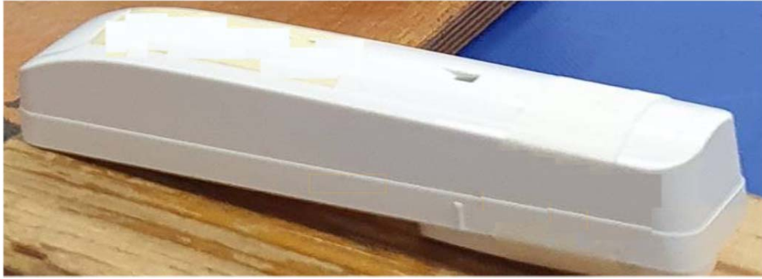
Photograph No.1 Shock detector "PG9935E" general view