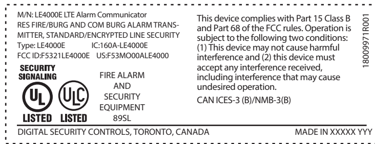
Label shown 200% of actual size

"XXXXX YYY" IS PLACEHOLDER ONLY. Please replace "XXXXX" with the country of origin and "YYY" with the UL factory ID (if applicable) before printing. Delete the "YYY" if there is no UL factory ID.