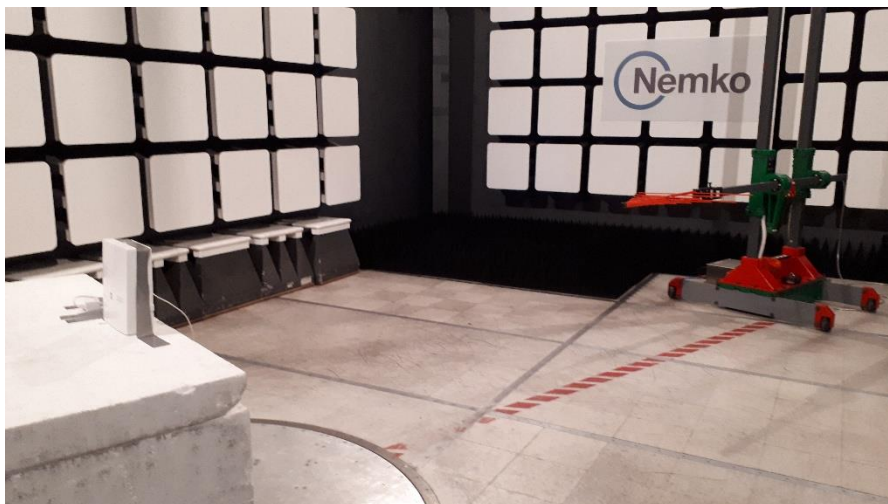
Radiated spurious (out-of-band) emissions setup photo – 30 to 1000 MHz