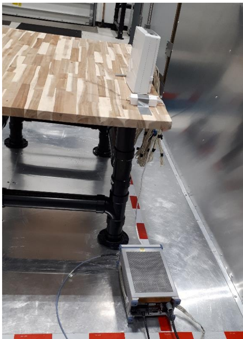
Conducted emissions setup photo