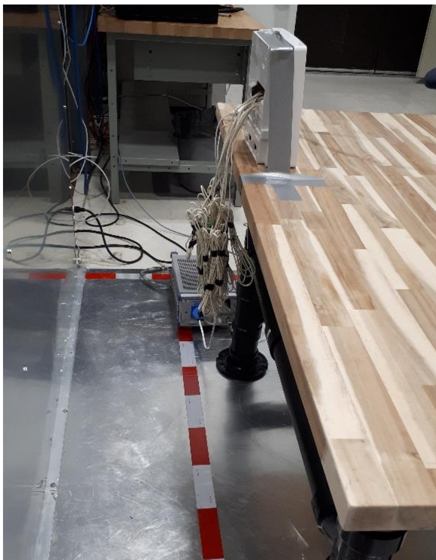
Conducted emissions setup photo