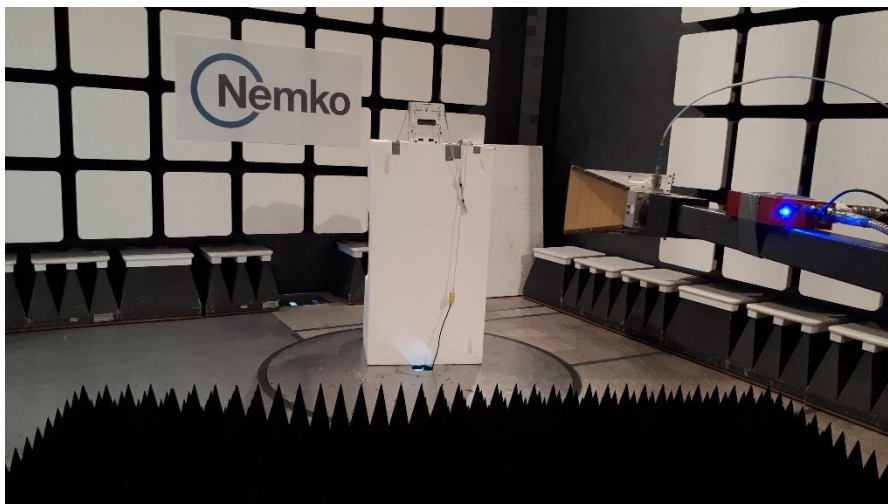
Radiated spurious (out-of-band) emissions setup photo – above 1 GHz