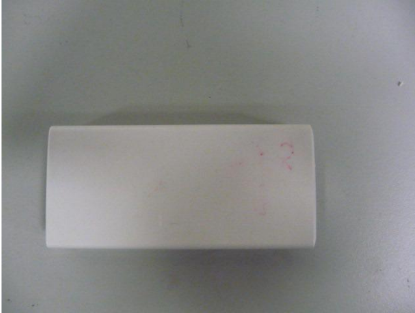
Photograph No.1 Wireless magnetic contact PG9303 Front view