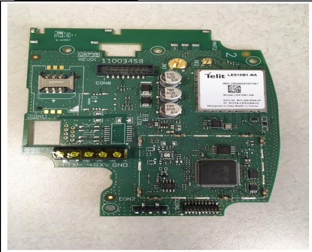
EUT - PCB Board Top View