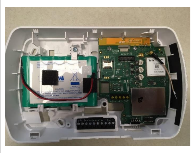
EUT - Cover Open View