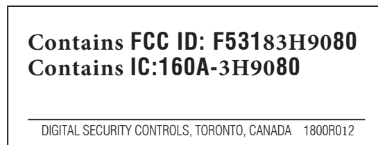
Label shown 150% of actual size