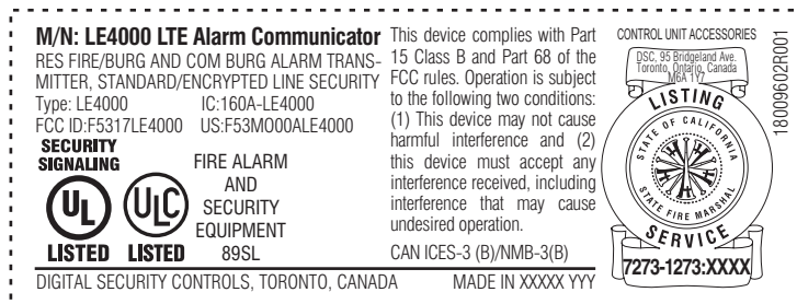
Label shown 200% of actual size

"XXXXX YYY" IS PLACEHOLDER ONLY. Please replace "XXXXX" with the country of origin and "YYY" with the UL factory ID (if applicable) before printing. Delete the "YYY" if there is no UL factory ID.