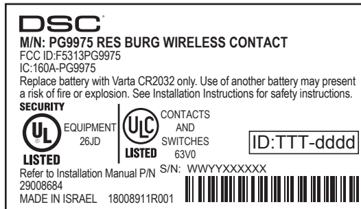
Label shown 200% of actual size