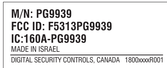
Label shown 300% of actual size