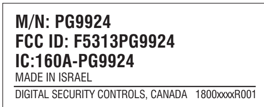
Label shown 300% of actual size