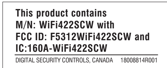
Label shown 300% of actual size