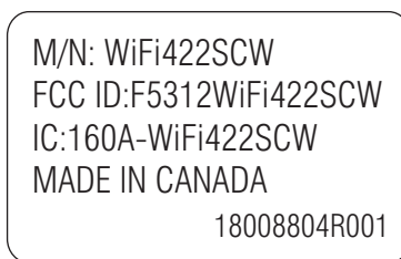
Label shown 300% actual size