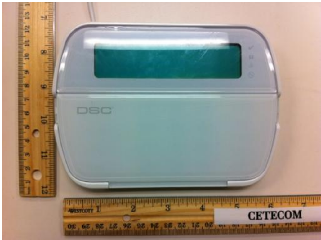
EUT AUX #1 Top