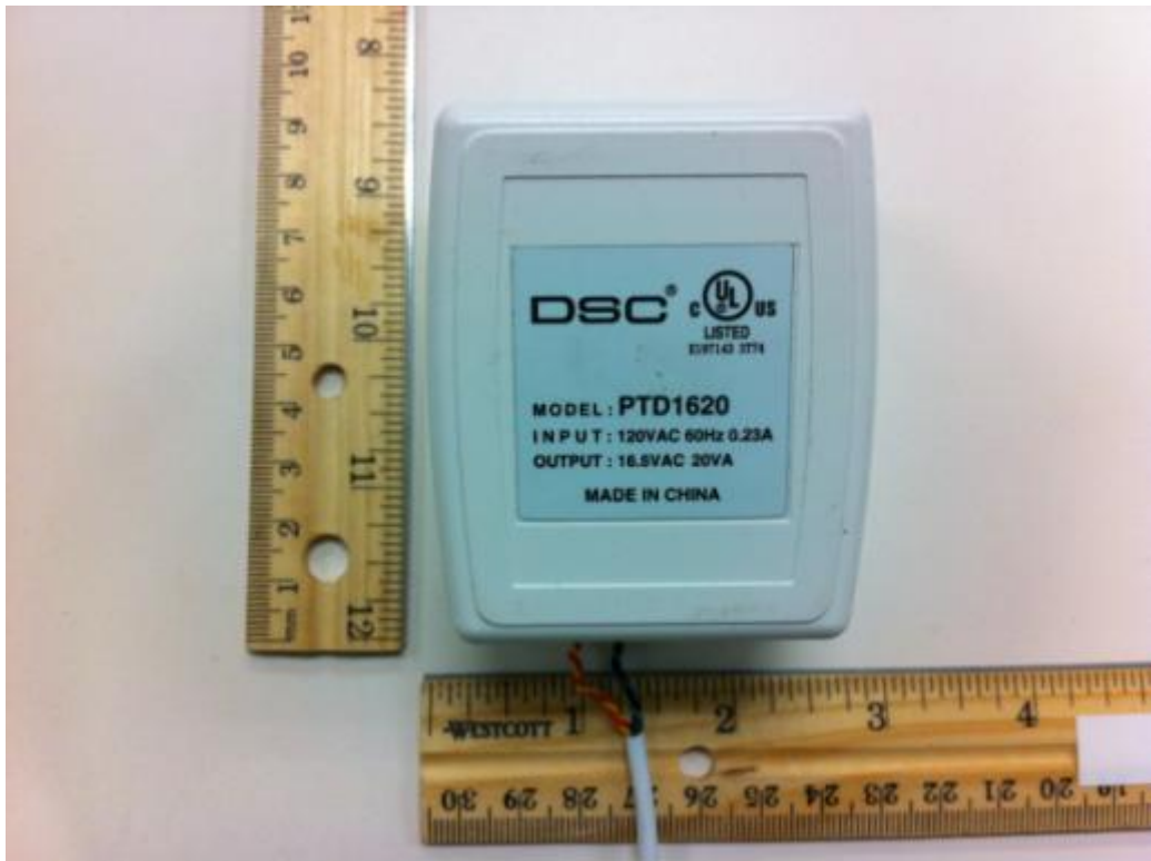
EUT AUX #2 Top