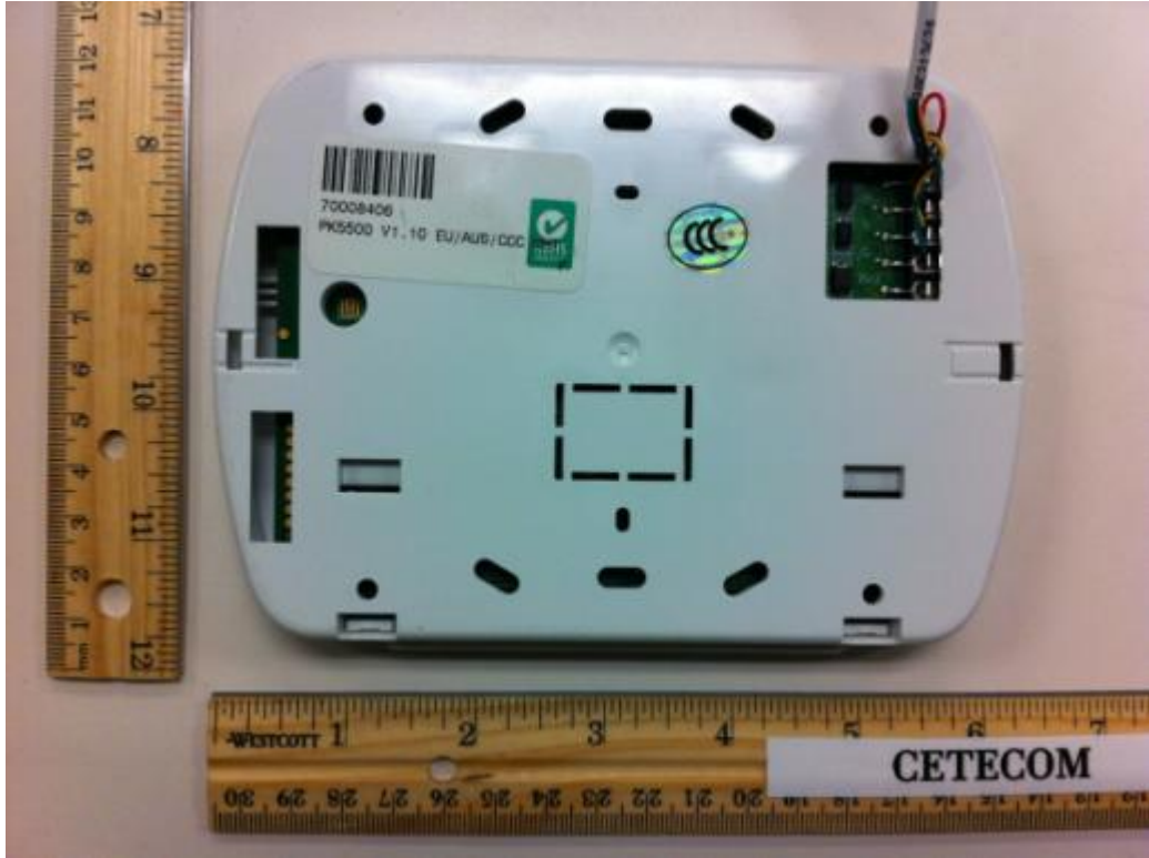
EUT AUX #1 Bottom