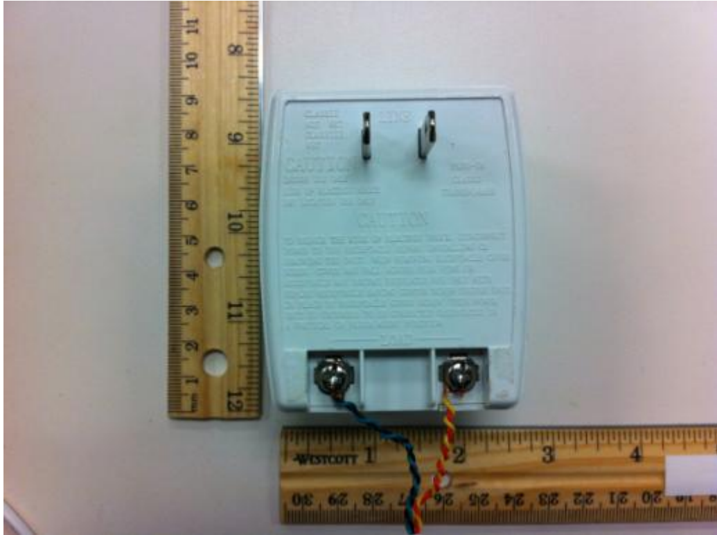
EUT AUX #2 Bottom