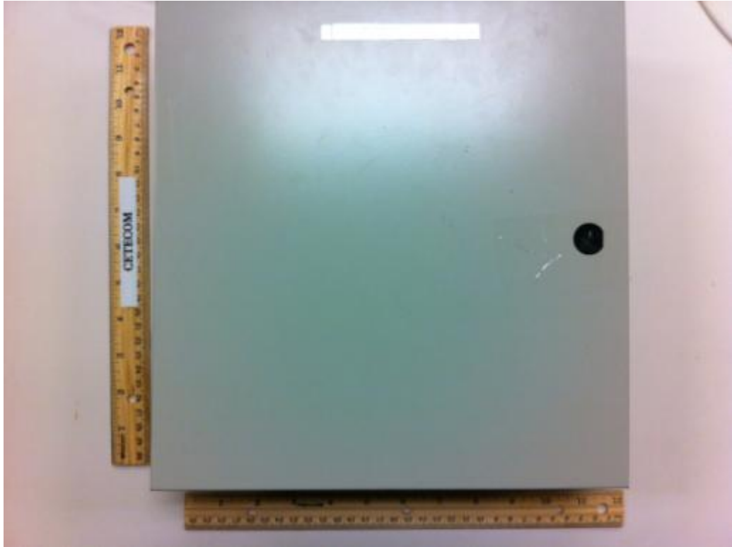
EUT Top with Cover