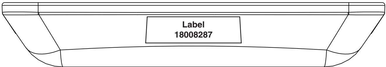
Top view of the unit showing the label location (80% of actual size)