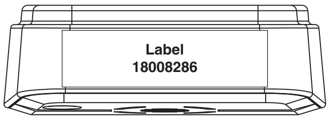
Top view of the unit showing the label location (actual size)