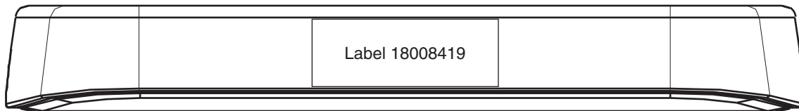
Top of the unit shows the label location (actual size)