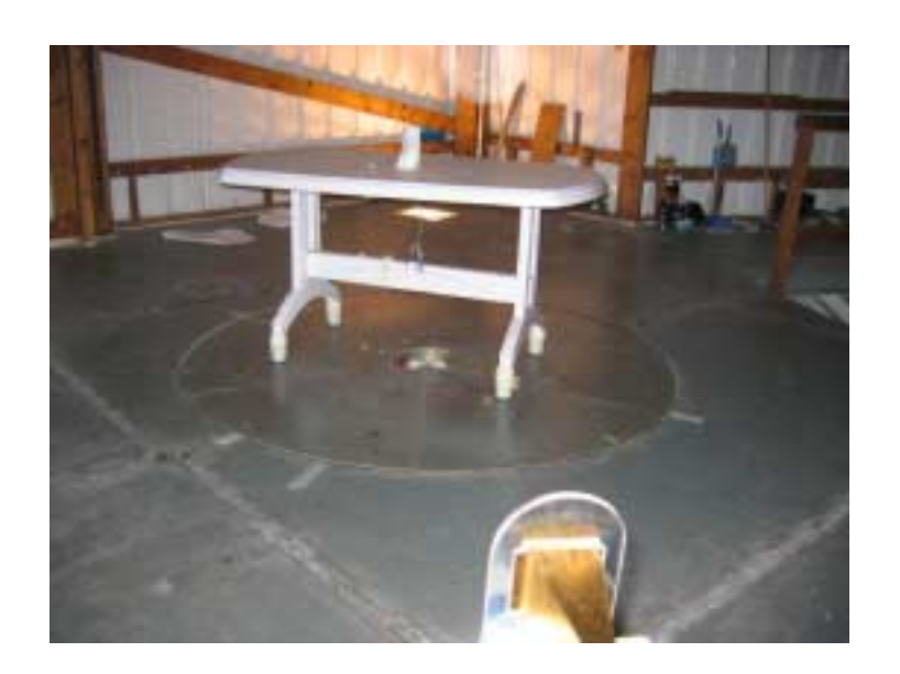
Photograph No.5 Setup for radiated emission measurements at the OATS from 26.5 to 40 GHz