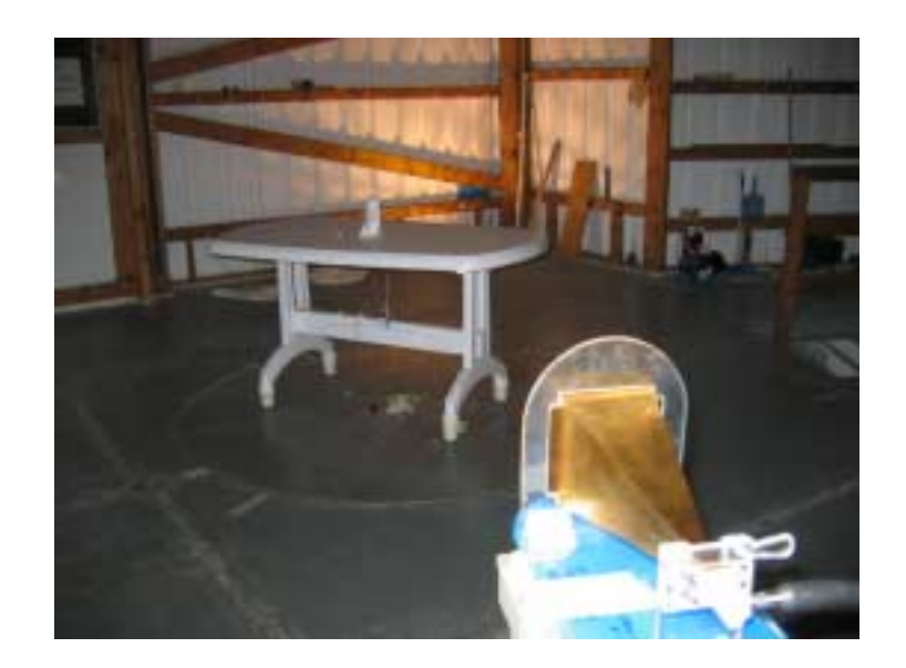
Photograph No.4 Setup for radiated emission measurements at the OATS from 18 to 26.5 GHz