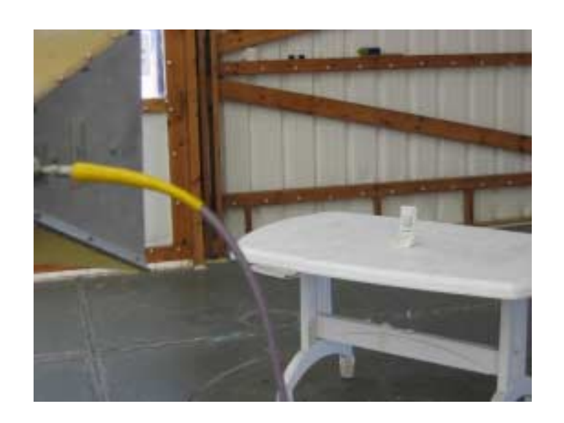
Photograph No.3 Setup for radiated emission measurements at the OATS from 1 to 18 GHz