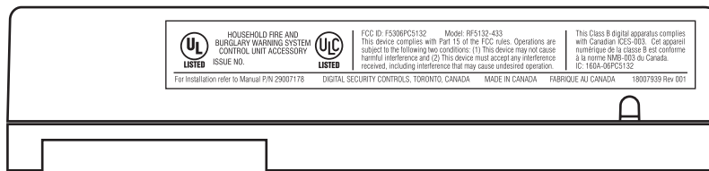
Side of the unit shows the label location (actual size)