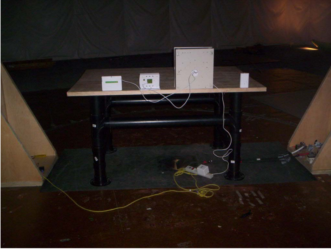
Radiated Emissions – Rear