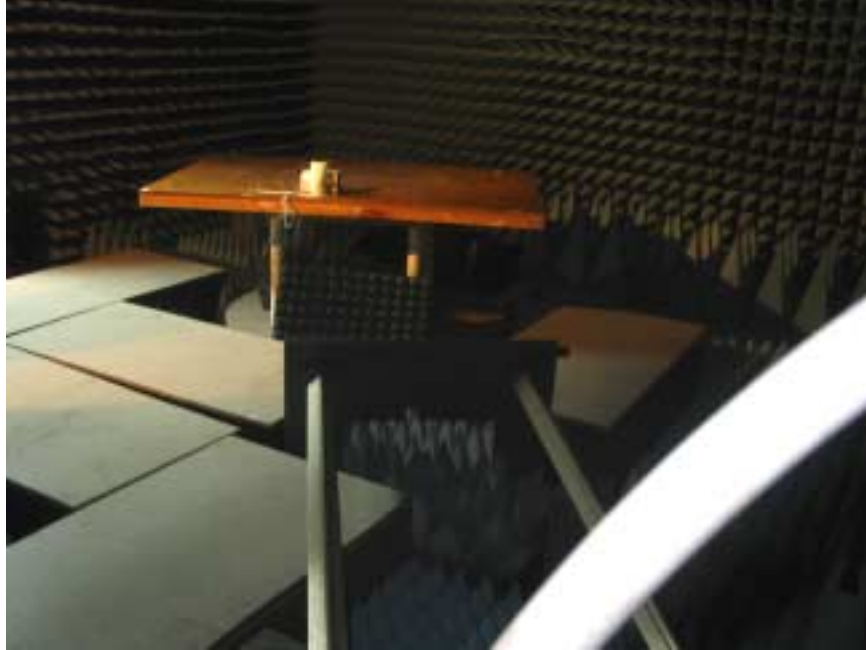
Photograph No.1 Setup for spurious emission field strength measurements in anechoic chamber below 30 MHz