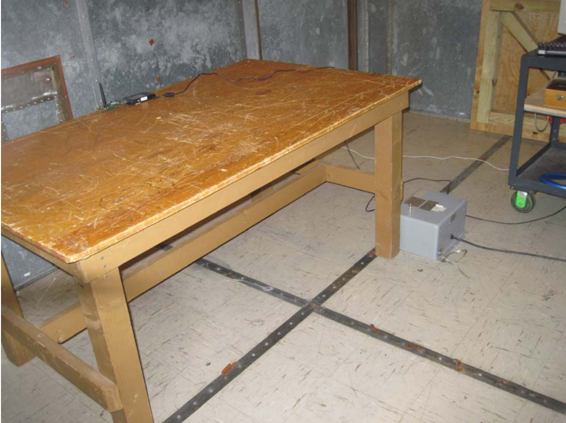
Photograph 5. CEV