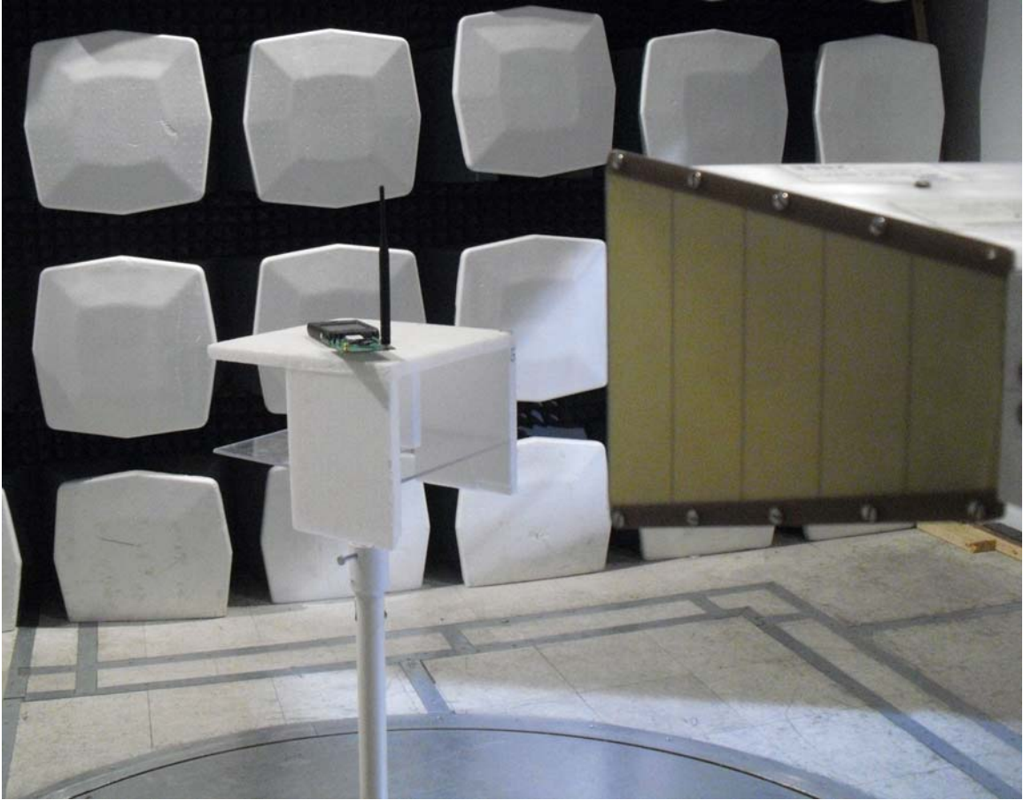
Photograph 3. Bandedge Test Setup 5 dBi