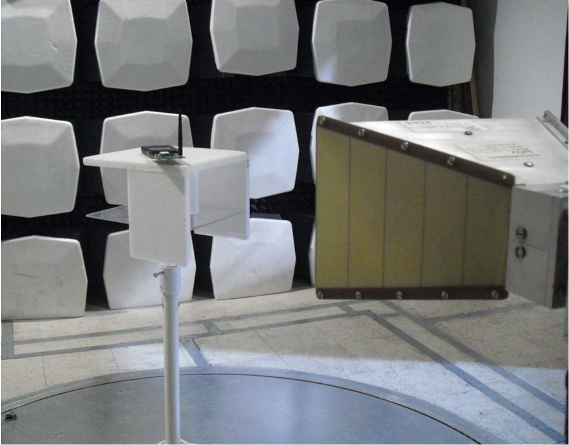
Photograph 2. Bandedge Test Setup 2 dBi