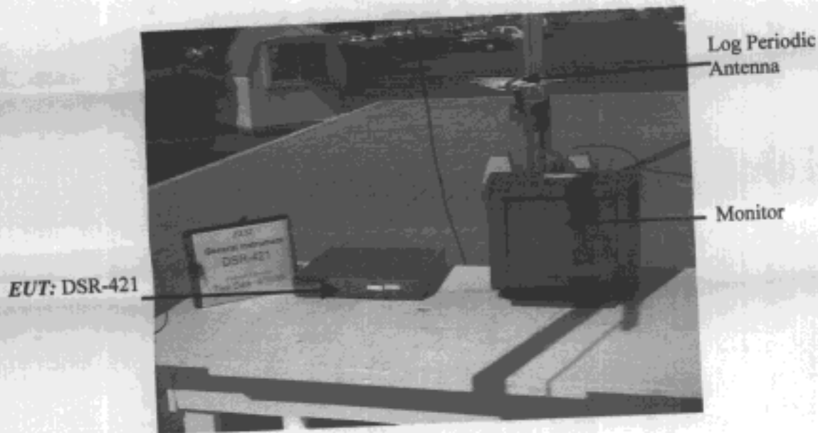
FIGURE 6. Radiated Emission Test Configuration