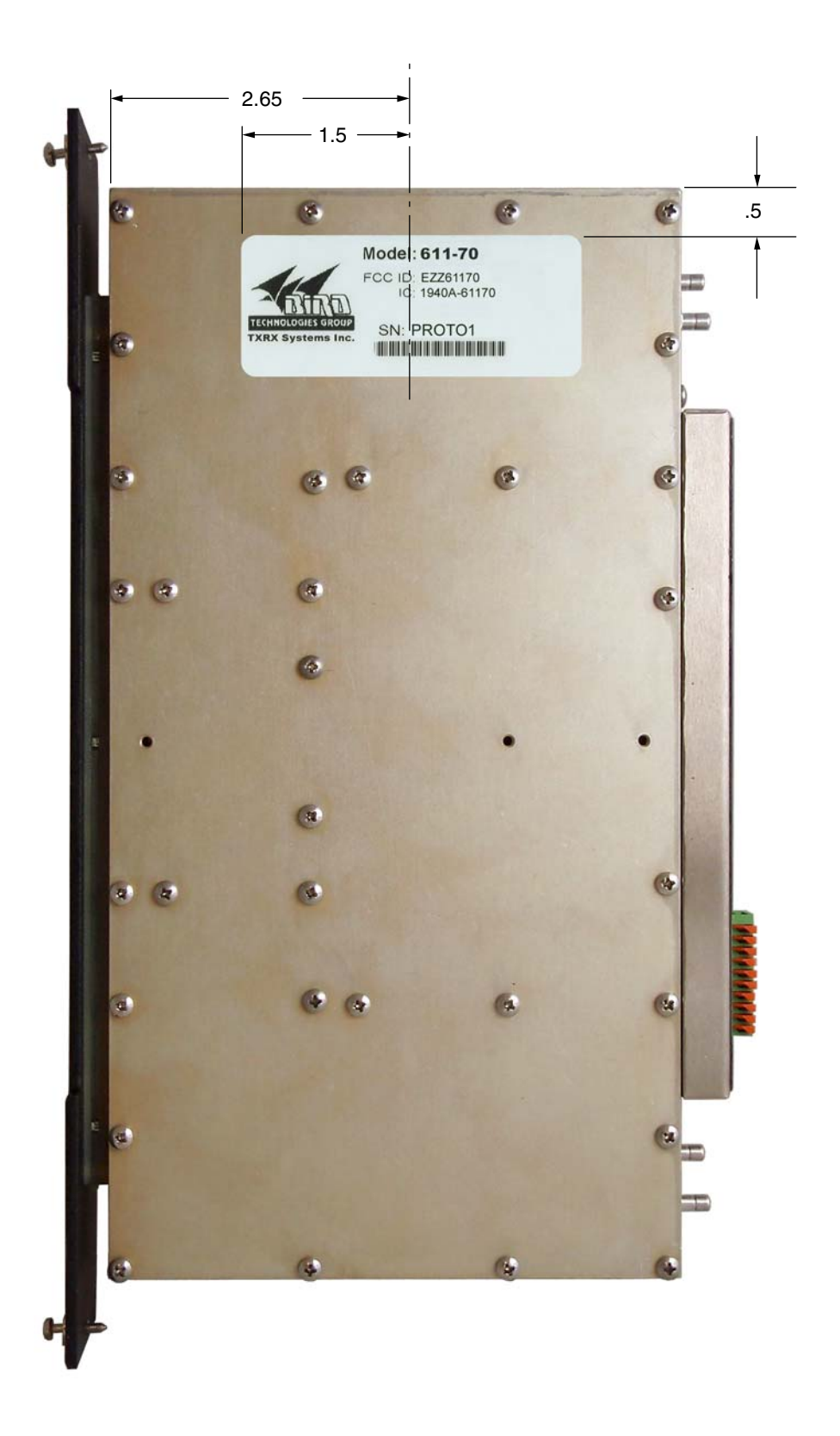
Label location when placed on module.